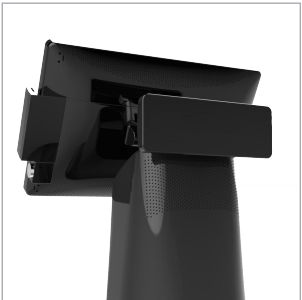
VFD (20 columns x 2 lines)