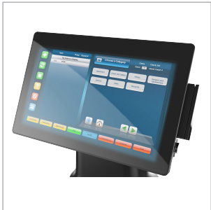
3 tracks USB type MSR card reader