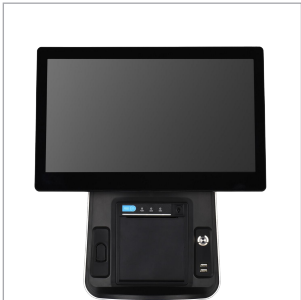
Integrated with 3 inch USB type receipt printer