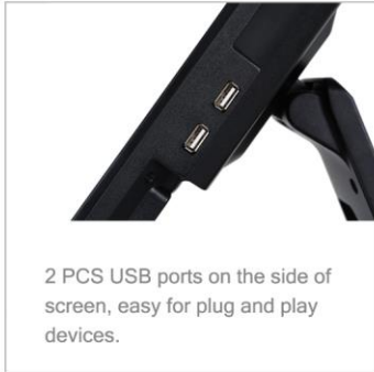
2 PCS USB ports on the side of screen, easy for plug and play devices.

high sensitivity projective capacitive touch screen supports 10-point touch control.