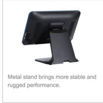
Metal stand brings more stable and rugged performance.