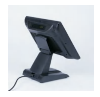
Built-in power adapter, space for tidy cabling