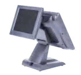
Striping ventilation holes, excellent dissipation capability