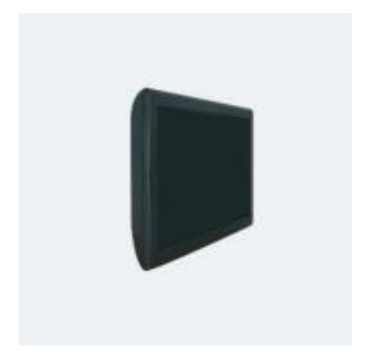
Wall mounted solution is specially designed for different commercial stores