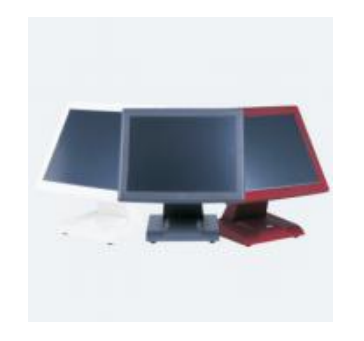
Colorful design, different colors are customizable for multiple businesses