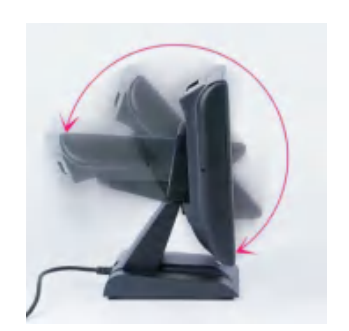
large angle rotation to meet the needs of different customer segments