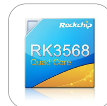
RK3568 ARM Cortex-A55 Quad-Core