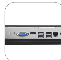
Rich I/O ports