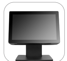
10.1" IPS Display 1280*800