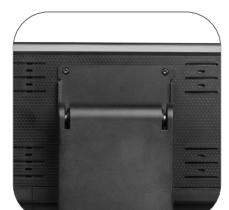
VESA Standard 75*75