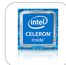
RK3568 ARM Cortex-A55 Quad-Core