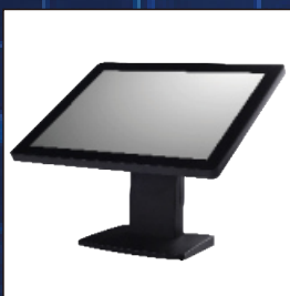
Ultra-wide angle rotatable bracket