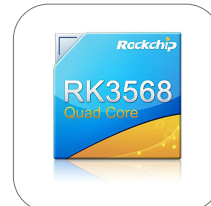
Rockchip ARM Cortex A17