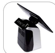
Customer Display VFD220