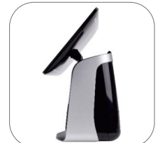
Cable Hidden Bracket