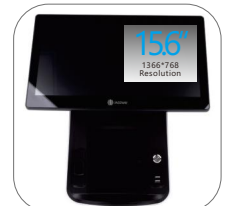
15.6 inch Bezel-Free True-Flat Projective Capacitive Touch Screen