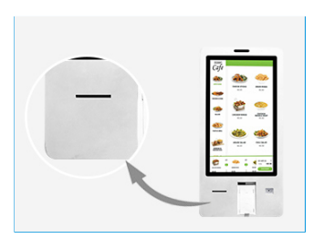
The Printer locked so the end user can't access paper roll.