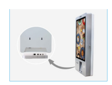
For additional ports can be customized