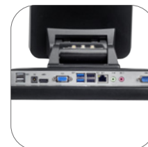
Multiple I/O ports to fit the customer's business