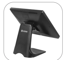
Aluminum fuselage design, higher heat conducting efficiency