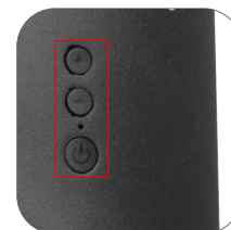
Brightness adjustment button