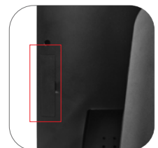
Reservation for MSR card reader