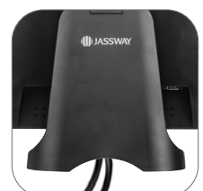
Brand new back cover with advanced cable management design