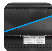
Top and bottom cooling holes for better heat dissipation